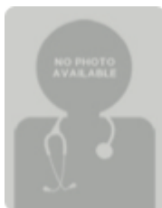
Jin Kim, D.O.

6101 Webb Road, #301 Tampa FL 33615 Phone: 813-885-3600